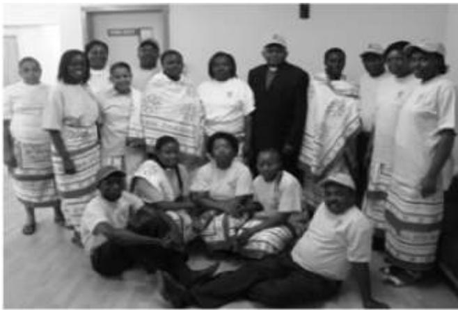
ACK staff during the Trade week of Action 19th October 2007

Most important, ordinary Kenyans started talking about global economic systems and agreements that have had great impact on their livelihoods and in areas like Mt. Kenya East CCS, locally organised protest marches and campaigns were effective in creating awareness and solidarity.