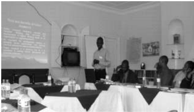
Action Research Training in Progress

In December 2007, we organised an Action Research Workshop for both the DOSS and CCS Staff, with an aim of building the staff's capacity in carrying out research. The training was attended by 24 participants drawn 7 CCSs and DOSS Office.