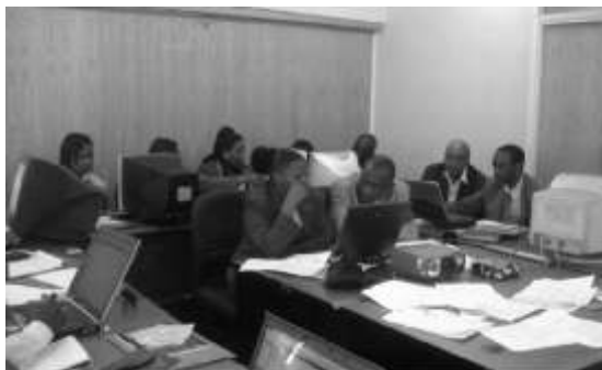
Training sessions - accountants' workshop

We also conducted training for ACK Accountants on application of QuickBooks Software in accounts. The course was attended by accountants from 12 Dioceses and 6 CCS Region. As a result of the training, Dioceses and CCS Offices have started computerising their accounts.