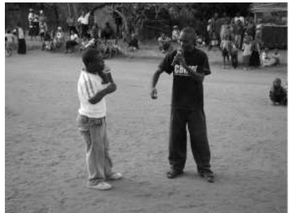
Educational community theatre in Malindi

The general performance of the project was commended (scoring about 80%). This was based on planned activities, the targeted groups, congregations and the outcome of those trainings. Congregations were stirred up to start reaching out to their members and neighborhood, attending to the affected and infected. The youth on the other hand reached out to their respective learning institutions. The groups that were trained earlier on puppetry were not only useful to their peers but also mobilized the community for the family dialogue road shows and community theatre. The provincial administrators and social workers invited the youth to perform during public meetings like launching of a