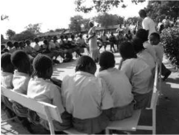
Training students issues on HIV & AIDS

The church promotes dialogue and listening to achieve the above goal. Creative messages are packaged to effectively address prevention, care and support, stigma reduction and relevant advocacy issues called Behavior Change Communication (BCC) messages.