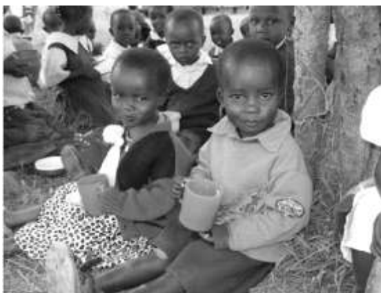
School feeding program in Kajiado

1. From the assessments it came out well that the communities have capacities and resources that need to be mobilized to reduce their vulnerabilities to recurring disasters.